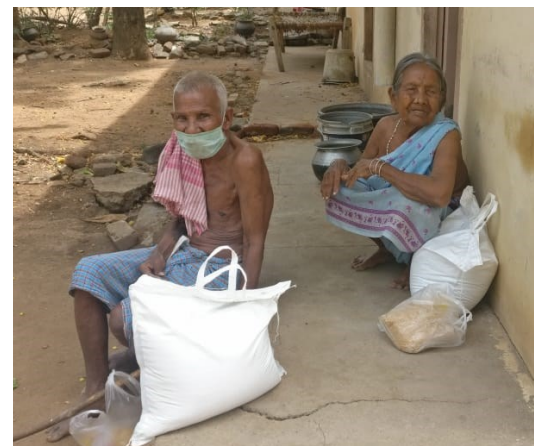
Food distribution by the Indian Christian Mission Centre.

The Secretary Anglican Aid Abroad PO Box 6134 Woolloongabba, Queensland, 4102 Australia