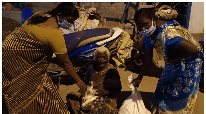
Food being distributed to the poor in Chennai. P.2

The Secretary Anglican Aid Abroad PO Box 6134 Woolloongabba, Queensland, 4102 Australia