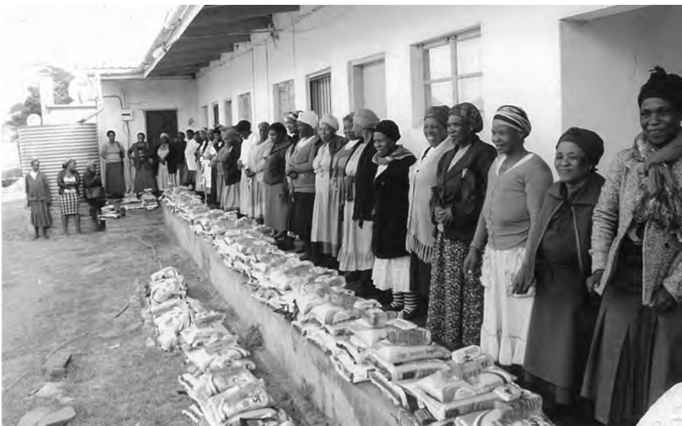
Some of the ladies waiting for all the goods to be distributed

Appropriately, the morning ends with a lunch of sandwiches and tea and a happy time of chatter before the ladies head for home.