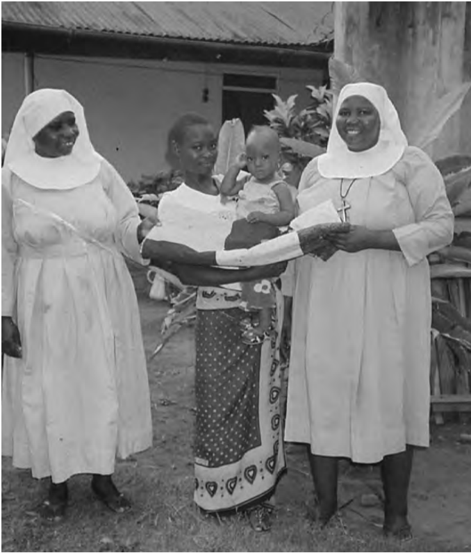
Clinics and family welfare programmes occupy much time. This little girl who had a bout of serious illness is now on the way home. A blanket made by The Sisters accompanies her.