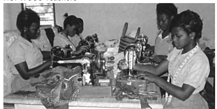
First Years - Sewing Lesson