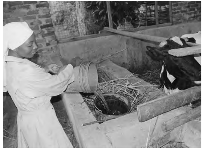
Farming is one of the ways in which the Sisters feed themselves and care for others and every day some can be found hard at work on their many farms.