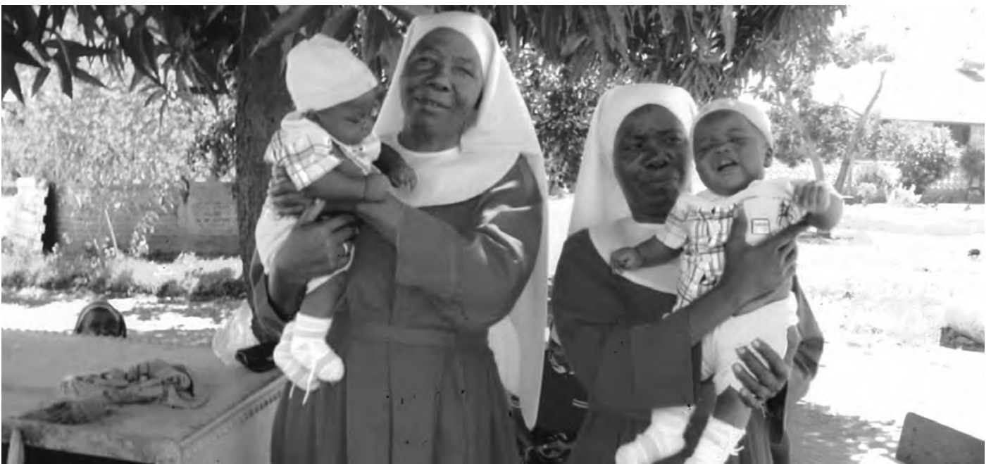
Two small twins are in the care of their grandmothers. The mother has died and their father abandoned them then. The Sisters assist the Grandmothers with needs such as food and clothing