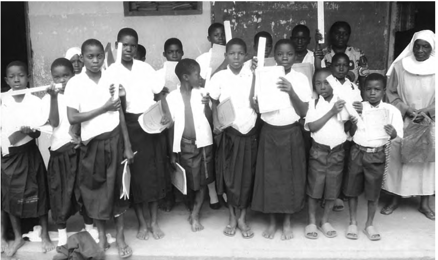
New school uniforms and some other needs are distributed to orphans at Napata Primary School. The children changed into the uniforms before being photographed. The large thing they hold is soap.